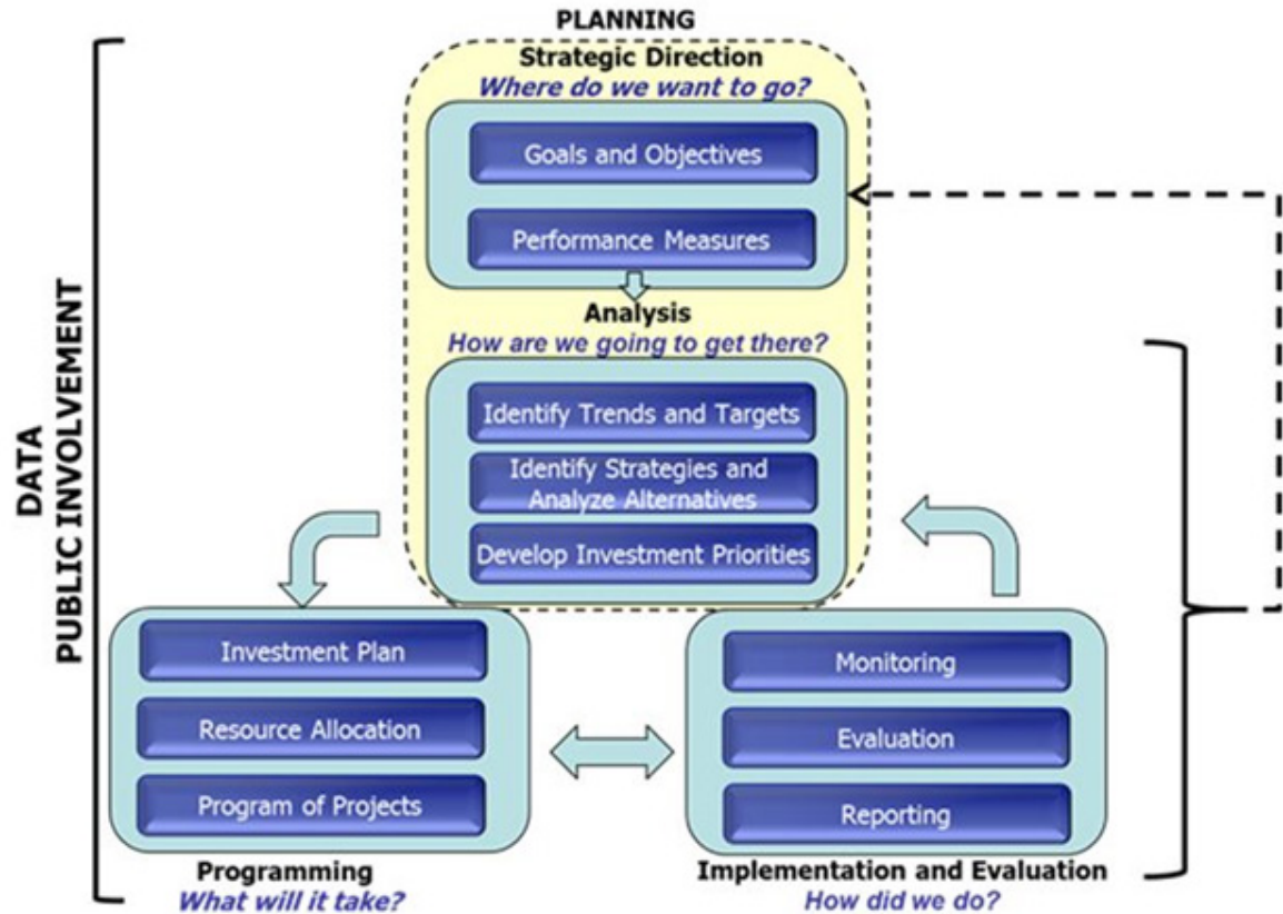
Flow chart describing the process for Performance Management, provided by the National Highway Institute

As a federal requirement, states will invest resources in projects to achieve individual targets that make collective progress toward national goals. MPOs are also responsible for developing LRTPs and TIPs through a performance-driven, outcome-based approach to planning.