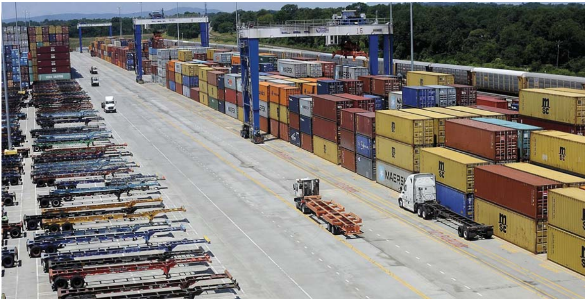
The South Carolina Inland Port opened in 2013 in Greer, SC.

General growth in traffic volumes will also increase potential conflicts at rail crossings. GPATS should monitor these trends and target roadways for improvement as necessary.